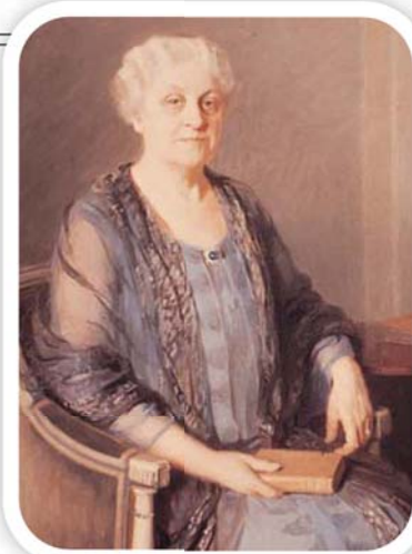
▲ Carrie Chapman Catt

Catt called an emergency suffrage convention in September 1916, and invited President Wilson, who cautiously supported suffrage. He told the convention, "There has been a force behind you that will . . . be triumphant and for which you can afford. . . . to wait." They did have to wait, but within four years, the passage of the suffrage amendment became the capstone of the progressive movement.