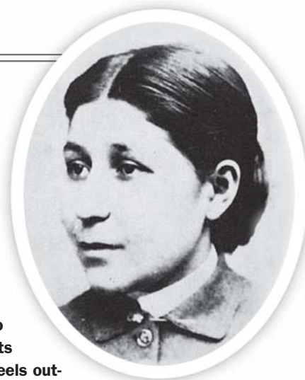
▲ Susette La Flesche

La Flesche testified before congressional committees and helped win passage of the Dawes Act of 1887, which allowed individual Native Americans to claim reservation land and citizenship rights. Her activism was an example of a new role for American women, who were expanding their participation in public life.