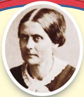
SUSAN B. ANTHONY 1820–1906