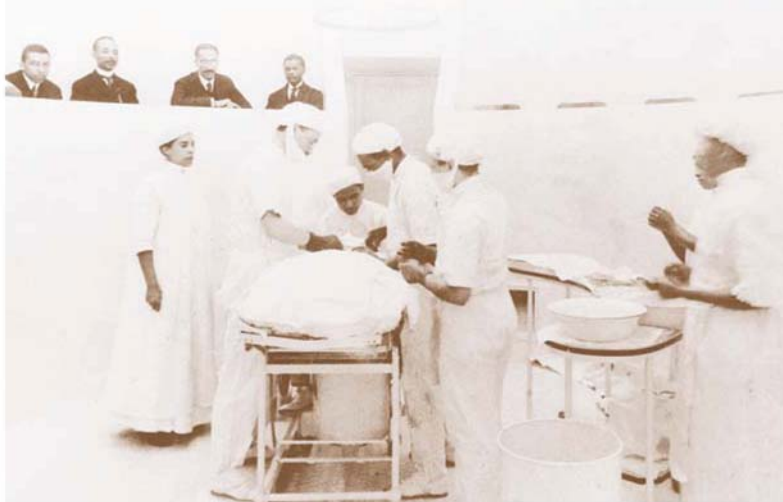
▲ Medical students and their professors work in the operating theater of the Moorland-Spingarn Research Center at Howard University.

By the turn of the 20th century, millions of people received the education they needed to cope with a rapidly changing world. At the same time, however, racial discrimination remained a thorn in the flesh of American society.