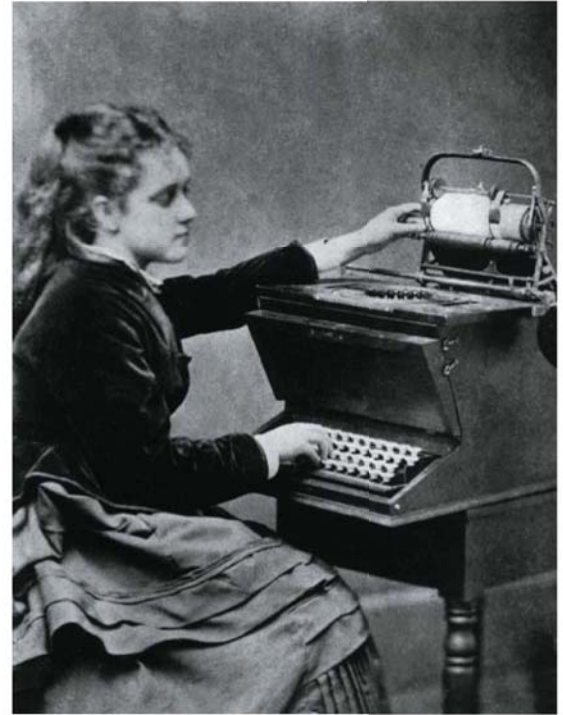
▲ The typewriter shown here dates from around 1890.

Industrialization freed some factory workers from backbreaking labor and helped improve workers' standard of living. By 1890, the average workweek had been reduced by about ten hours. However, many laborers felt that the mechanization of so many tasks reduced human workers' worth. As consumers, though, workers regained some of their lost power in the marketplace. The country's expanding urban population provided a vast potential market for the new inventions and products of the late 1800s.