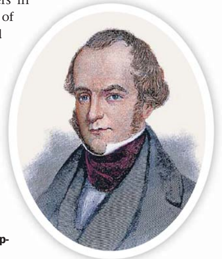
Stephen F. Austin

—quoted in Lone Star: A History of Texas and Texans