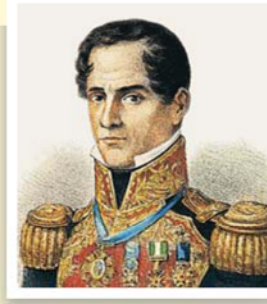
SANTA ANNA 1795–1876

The Republic of Texas chose Houston to be its first president. When Texas became a state, he was elected to the U.S. Senate.