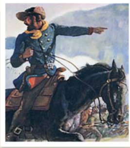
SAM HOUSTON 1793–1863

Sam Houston ran away from home in Tennessee at about age 15 and lived for three years with the Cherokee. He later fought in the U.S. Army, studied law, was elected to Congress, and became governor of Tennessee.