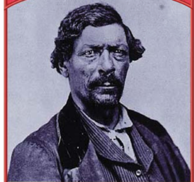
JIM BECKWOURTH 1798–1867?

James Pierson Beckwourth (or Beckwirth) was the toughest kind of pioneer, a mountain man. The son of an African-American woman, he ventured westward with a fur-trading expedition in 1823 and found the place that would become his home for nearly the next quarter century—the Rocky Mountains. He greatly impressed the Crow, who gave him the name “Bloody Arm” because of his skill as a fighter.