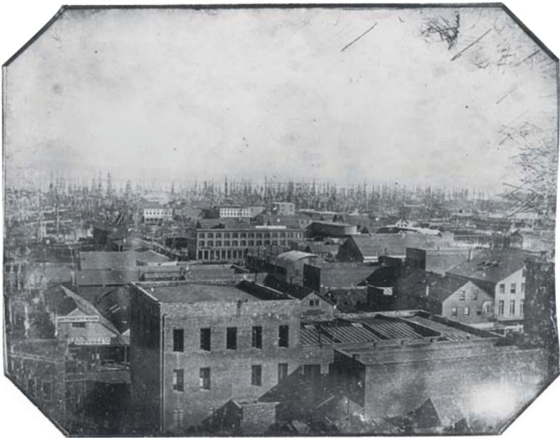
▲ Crowded buildings and a forest of masts stand out in this 1850 photograph of San Francisco.

the mining camps that sprung up in California reflected the diversity of its growing population: French Corral, Irish Creek, Chinese Camp. G