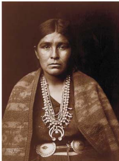
A Navajo man and woman in photographs taken by Edward S. Curtis.