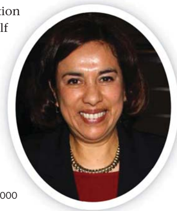
Antonia Hernandez, MALDEF's president 1985–2003

Data from the 2000 census revealed that the Hispanic population had grown by close to 58 percent since 1990, reaching 35.3 million. The 2000 census also confirmed a vast increase in what were once ethnic minorities.