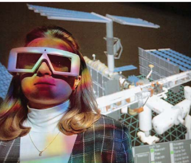
▲ At NASA Langley Research Center in Virginia, an aerospace engineer wearing stereo glasses sees a 3-D view of a space station simulation, as shown in the background.

The exciting growth in the telecommunications industry in the 1990s was matched by insights that revolutionized robotics, space exploration, and medicine. The world witnessed marvels that for many of the “baby boom generation,” people born in the late 1940s and the 1950s, echoed science fiction.