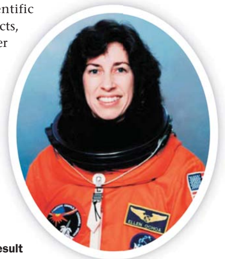
Dr. Ellen Ochoa

BIOTECHNOLOGY The most profound insight into the book of life came from the field of biotechnology. The Human Genome Project, an international effort to map the genes of the human body, and Celera, a private company in molecular biology, simultaneously announced in 2000 that they had sequenced nearly all of the human genome only a decade after the research began. Cooperation via the Internet and access to computerized databases by multiple research groups vastly accelerated the scientists' ability to identify and order over three billion chemical