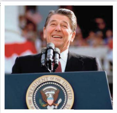
President Ronald Reagan

—televised speech to the nation, February 5, 1981