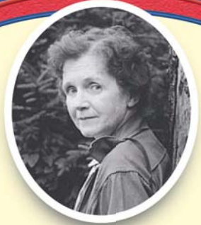
RACHEL CARSON 1907–1964

The marine biologist Rachel Carson was born far from the sea, in the small town of Springdale, Pennsylvania.