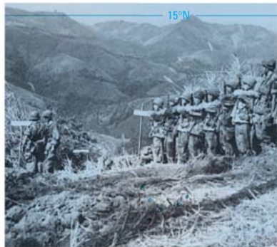
After parachuting into the mountains north of Dien Bien Phu, South Vietnamese troops await orders from French officers in 1953.