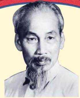
HO CHI MINH 1890–1969

Born Nguyen Tat Thanh to a poor Vietnamese family, Ho Chi Minh (which means "He Who Enlightens") found work as a cook on a French steamship. This allowed him to visit such cities as Boston and New York.