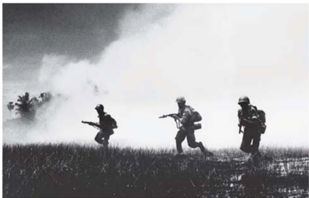
The swampy terrain of South Vietnam made for difficult and dangerous fighting. This 1961 photograph shows South Vietnamese Army troops in combat operations against Vietcong