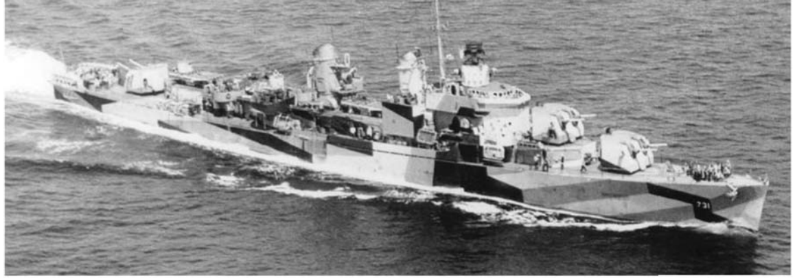
▲ The Navy destroyer U.S.S. Maddox .

Two days later, the Maddox and another destroyer were again off the North Vietnamese coast. In spite of bad weather that could affect visibility, the crew reported enemy torpedoes, and the American destroyers began firing. The crew of the Maddox later declared, however, that they had neither seen nor heard hostile gunfire.