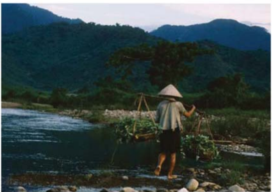
Rivers serve as places to work, bathe, and wash clothing.