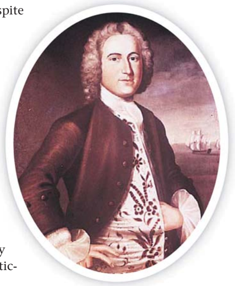
▲ Portrait of a young John Adams by Joseph Badger

The election also underscored the growing danger of sectionalism—placing the interests of one region over those of the nation as a whole. Almost all the electors from the Southern states voted for Jefferson, while all the electors from the Northern states voted for Adams.