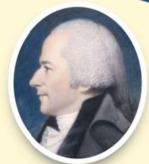
ALEXANDER HAMILTON 1755–1804

A Southern planter, Jefferson was also an accomplished scholar, the architect of Monticello (his Virginia house), an inventor (of, among other things, a machine that made copies of letters), and the founder of the University of Virginia in 1819. Despite his elite background and his ownership of slaves, he was a strong ally of the small farmer and average citizen.