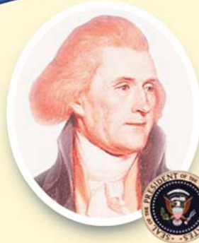
THOMAS JEFFERSON 1743–1826

The writer of the Declaration of Independence, Thomas Jefferson began his political career at age 26, when he was elected to Virginia’s colonial legislature. In 1779 he was elected governor of Virginia, and in 1785 he was appointed minister to France. He served as secretary of state from 1790 to 1793.