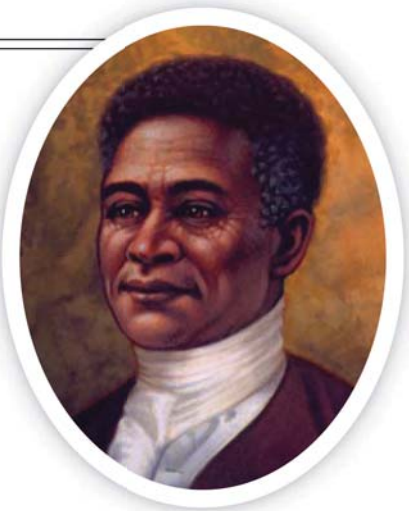
▲ Crispus Attucks

—quoted in The Black Presence in the Era of the American Revolution