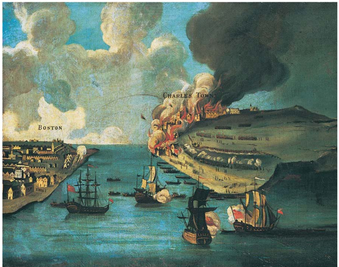
▲ This painting shows “Bunker’s Hill” before the battle, as shells from Boston set nearby Charles Town ablaze. At the battle, the British employed a formation they used throughout the war. They massed together, were visible for miles, and failed to take advantage of ground cover.

King George flatly rejected the petition. Furthermore, he issued a proclamation stating that the colonies were in rebellion and urged Parliament to order a naval blockade to isolate a line of ships meant for the American coast.