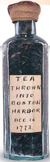
▲ This bottle contains tea that colonists threw into Boston harbor during the Boston Tea Party.

Minutemen intercepted the British and engage in battle—first at Lexington, and then at Concord.