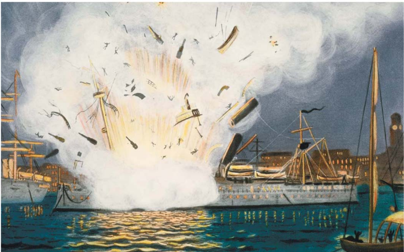
▲ When the U.S.S. Maine exploded in the harbor of Havana, newspapers like the New York Journal were quick to place the blame on Spain.

Now there was no holding back the forces that wanted war. “Remember the Maine! ” became the rallying cry for U.S. intervention in Cuba. It made no difference that the Spanish government agreed, on April 9, to almost everything the United States demanded, including a six-month cease-fire.