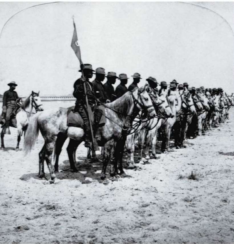
▲ These African-American troops prepare for battle during the Spanish-American War.

The Rough Riders trained as cavalry but fought on foot because their horses didn't reach Cuba in time.