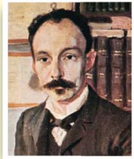
JOSÉ MARTÍ 1853–1895

The Cuban political activist José Martí dedicated his life to achieving independence for Cuba. Expelled from Cuba at the age of 16 because of his revolutionary activities, Martí earned a master's degree and a law degree. He eventually settled in the United States.